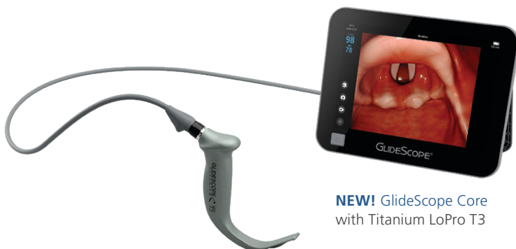
NEW! GlideScope Core with Titanium LoPro T3