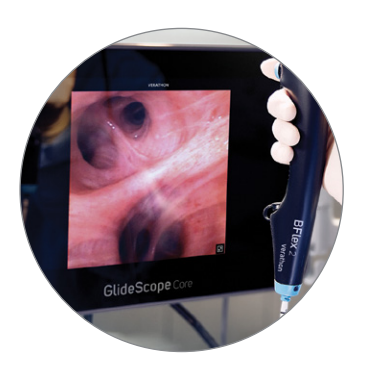
Brilliant visualization with Dynamic Light Control® and anti-fog technology