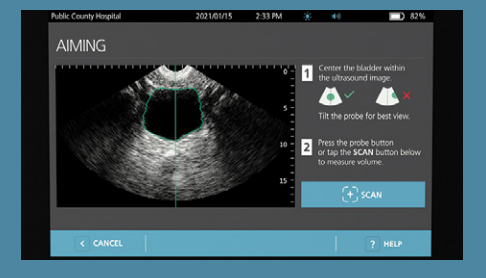
Accuracy for Every User