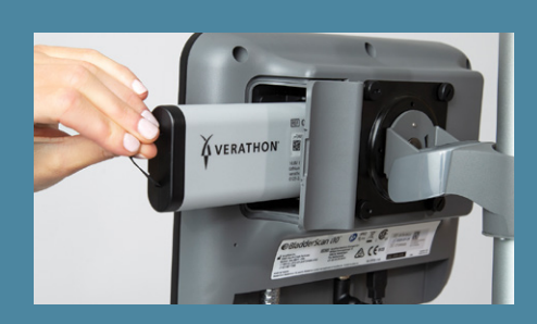
Flexible Power Management