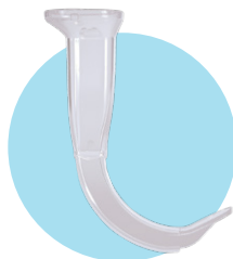
SINGLE-USE GVL® STATS