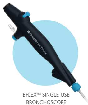
BFLEX™ SINGLE-USE BRONCHOSCOPE