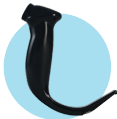
SPECTRUM™ SINGLE-USE VIDEO LARYNGOSCOPE