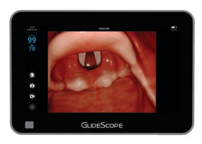
GlideScope Core 15