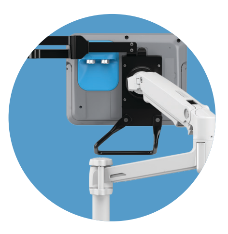
DUAL CONNECTION PORTS WITH QUICKCONNECT™ TECHNOLOGY