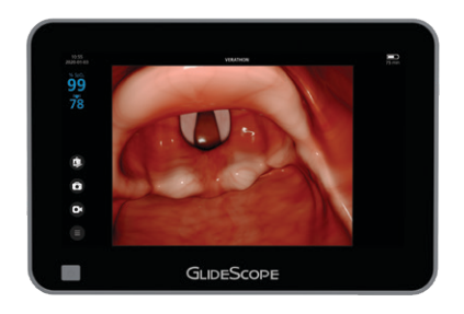
GlideScope Core 15