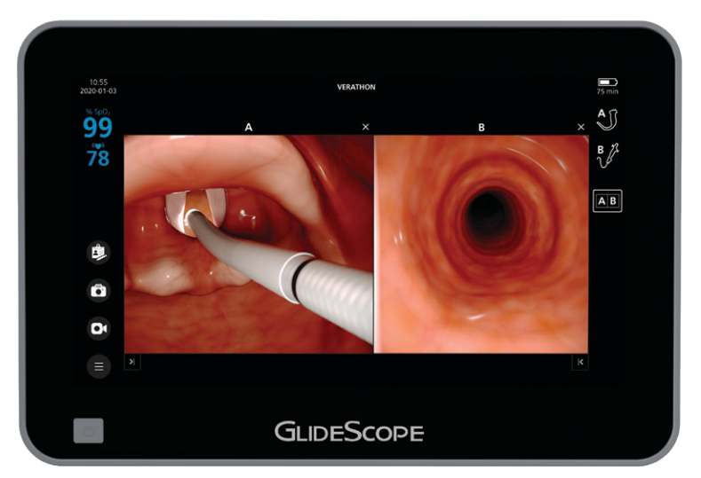
GLIDESCOPE CORE 15