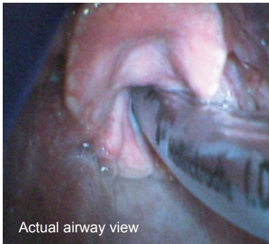
Actual airway view

Whether it's in the ED, the OR, or the ICU, patients present in all shapes and sizes. So it's important to choose an airway device that's right for them: the GlideScope GVL.