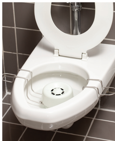
Sets up in a standard toilet.