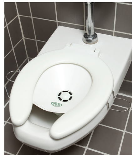
Includes convenient funnels.