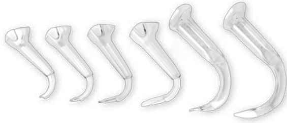
Stat sizes 0, 1, 2, 2.5, 3, 4