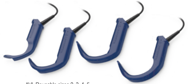
AVL Reusable sizes 2, 3, 4, 5