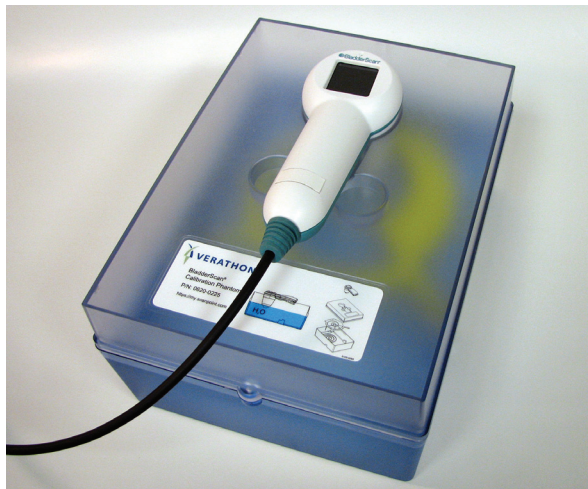
Calibrate your BladderScan instrument online