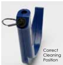
Cobalt Video Baton