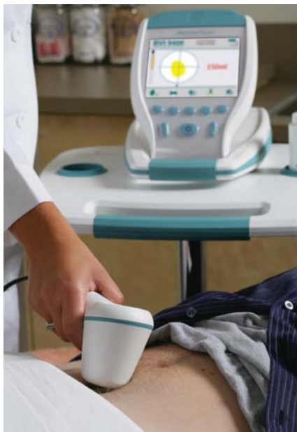
BladderScan® BVI 9400